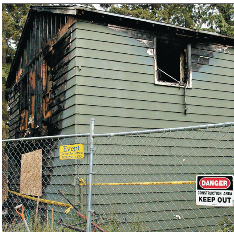
PETER STRONG | THE DAILY BAROMETER