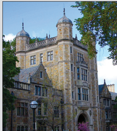
Lawyer's Club, University of Michigan.

Metropolitan Statistical Area Population: 345,128