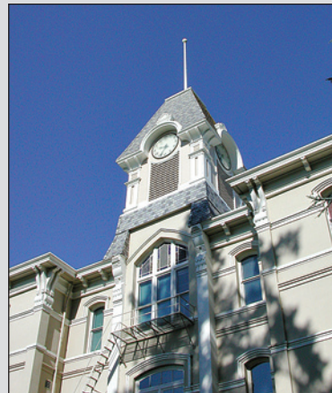
Benton Hall, Oregon State University.

Metropolitan Statistical Area Population: 81,105