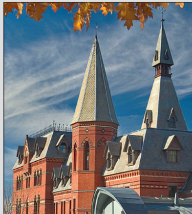
The Sage Residential College, Cornell University.

Metropolitan Statistical Area Population: 103,641