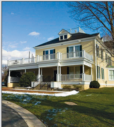
City Hall, Gaithersburg, Maryland.

Metropolitan Division Population: 1,158,319